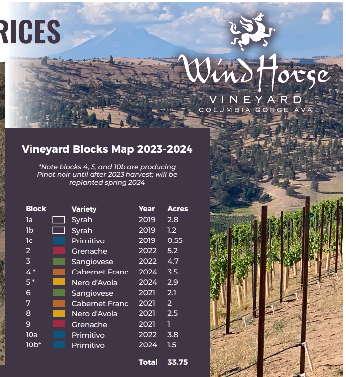
Vineyard Blocks Map 2023-2024

*Note blocks 4, 5, and 10b are producing Pinot noir until after 2023 harvest; will be replanted spring 2024